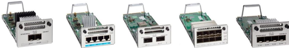
Figure 3. Cisco Catalyst 9300 Series Network Modules