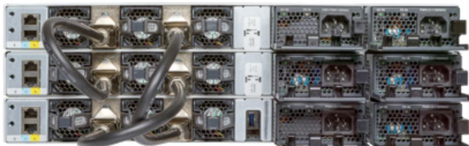
Figure 6. Cisco Catalyst 9300 Series fixed uplink models with optional stack kit