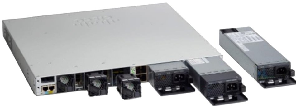
Figure 4. Cisco Catalyst 9300 Series Dual Redundant power supplies

Cisco Catalyst 9300 Series switches support dual redundant power supplies. The switches ship with one power supply by default, and the second power supply can be purchased when the switch is ordered or at a later time. If only one power supply is installed, it should always be in power supply bay #1. The switches also ship with three field-replaceable fans. Power Supplies are common across the Catalyst 9300 Series.