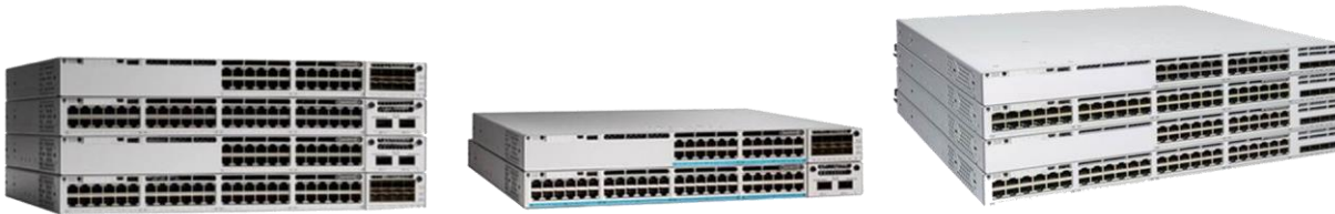
Figure 1. Cisco Catalyst 9300 Series switches

The Cisco Catalyst 9300 Series is made up of nineteen modular uplink switch models and fourteen fixed uplink switch models.