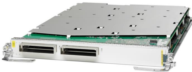
Figure 1. Cisco ASR 9000 Series 2-Port 100 Gigabit Ethernet Line Card

Remove bandwidth bottlenecks from increased video-on-demand (VoD), IPTV, point-to-point video, Internet video, and cloud services traffic with the Cisco® ASR 9000 Series 2-Port 100 Gigabit Ethernet Line Cards (Figure 1). These powerful line cards deliver an industry-leading two 100 Gigabit Ethernet ports to any slot of a Cisco ASR 9000 Series Aggregation Services Router. Large 10 Gigabit Ethernet link aggregation bundles can now be replaced by a single 100 Gigabit Ethernet port to simplify network designs. These line cards deliver economical, scalable, highly available, line-rate Ethernet and IP/Multiprotocol Label Switching (MPLS) edge services. Both Cisco ASR 9000 Series line cards and Cisco ASR 9000 Series Routers are designed to provide the fundamental infrastructure for scalable Carrier Ethernet and IP/MPLS networks, to promote profitable business, residential, and mobile services.